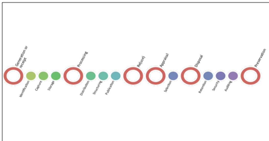
Figure 3. The Information Value Chain according to Van Bussel (2012)

IM organizes the Information Value Chain (IVC) to identify, control, and manage data and ICTs in and between organisations. This chain ensures that the informational and evidential value of (big) data is utilised in and between business processes to improve performance, privacy, and security by safeguarding the four dimensions of information: quality, context, relevance, and survival (Van Bussel, Ector, 2009; Van Bussel, 2012a; Van Bussel, 2012b). The IVC is a business process model that includes all IM processes within the data flow: generation or receipt, identify, capture, storage, processing, distribution, structuring, publication, (re-) use, appraisal, selection, disposal, retention, security, auditing and preservation. The IVC (see Figure 3) is instrumental in [1]