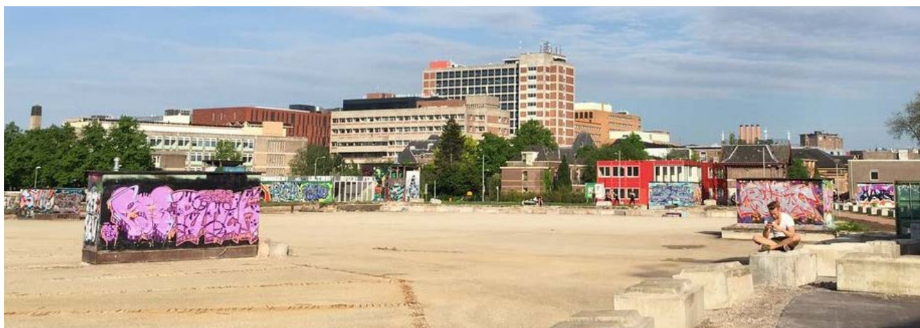
FIGURE 3 Temporary users of the Ebbingekwartier in 2017: sea containers housed creative entrepreneurs.

a hotel, mid to high range housing units and some space for the local university (von Schönfeld et al., 2019). In essence, the new stakeholders (entrepreneurs and creatives) were allowed to program the area temporarily but were not involved in how the restart of development would be. Inspired by the success of the Ebbinge quarter, the city of Groningen proceeded to incorporate the same strategy for the Suikerunie brown-field location as the next housing expansion location in the city. Again, temporary use of the location was granted to creative entrepreneurs, and it seems likely their input will not affect new development outputs and outcomes (De Nijs et al., 2020).