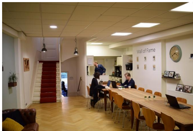
Figure 6: Communal space at StartDock for lunch and social events