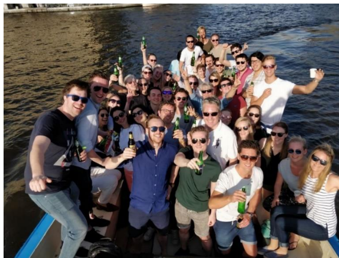
Figure 7: Example of a social event at StartDock