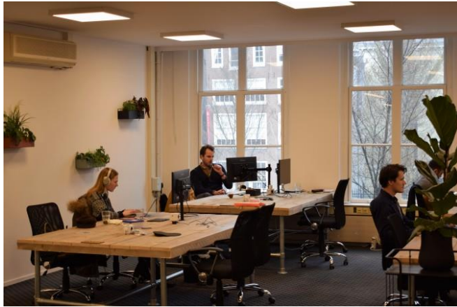
Figure 5: Shared office space at StartDock