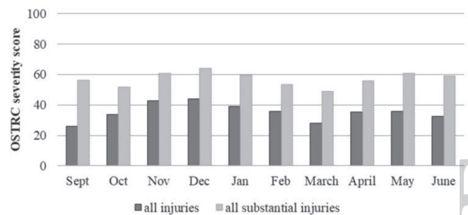
Figure 2 Mean monthly OSTRC severity scores of all and substantial injuries during the full academic year of 2016/2017. OSTRC, Oslo Sports Trauma Research Centre.

two consecutive questionnaires and therefore did not calculate as a unique injury. The 105 students reported on average 2.0 unique injuries (range 1–7) during the academic year. As shown in Figure 3 , 25 students (19.2%) did not report any injuries, 27 students (20.8%) reported one unique injury, 36 students (27.7%) reported two unique injuries and 42 students (32.3%) three or more unique injuries during the academic year.