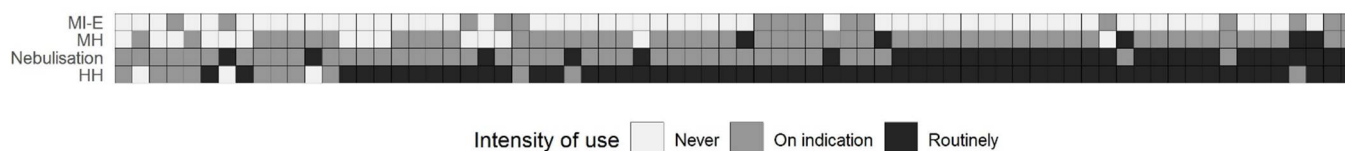
Figure 1. Heatmap airway care interventions in Dutch ICUs (N = 72). Current practice of heated humidification (HH), nebulization therapy, manual hyperinflation (MH) and MI-E in Dutch ICUs is graphically displayed in a heatmap. Each vertical bar is one ICU. Intensity of use of the airway care interventions is visualized by different shadings of grey according to the legend.

* ICU nurses with additional education 14 month program on mechanical ventilation 240 study hours; † a non-academic hospital in which healthcare professionals are trained and educated. ICU, Intensive Care Unit.