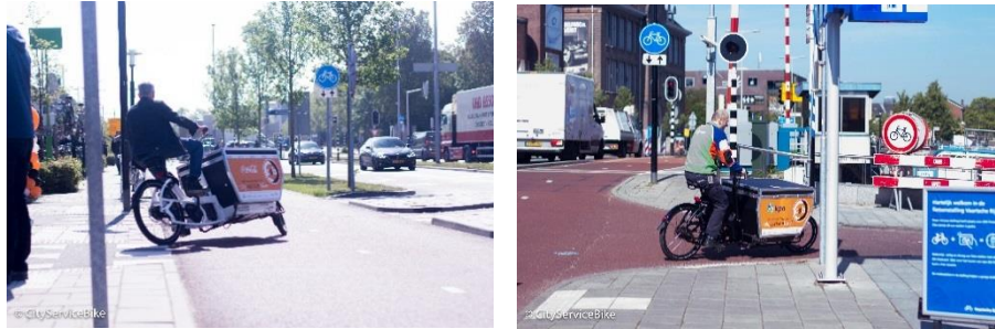
Figure 4 Field service engineers on electric cargo bikes