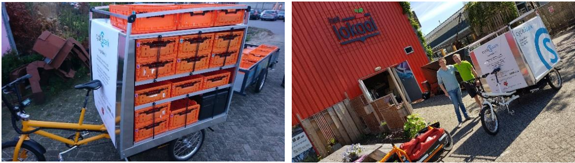
Figure 1 CycleSpark CargoBikeXL

Greenolution has developed the CycleSpark CargoBikeXL which is tested by 2Wielkoeriers (local bike courier) for food distribution in Amersfoort (see Figure 1). Het Lokaal is a market hall for organic food, which values a sustainable distribution of its products. The large volume and weight payload of the CargoBikeXL, which is comparable with a delivery van, makes it a unique solution for the heavy goods of Het Lokaal. Bike courier 2Wielkoeriers has tested the CargoBikeXL every Monday starting in April 2017.