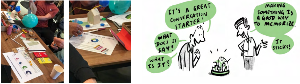
Figure 2: Photos of the dataphys workshop and data sheets (left) and data physicalization as interpreted by live-cartoonist (Right).

Physical thematic analysis of participants' 33 red and 29 green cards (N=62) from the intro activity (Fig. 3) uncovered that participants' input mainly focused on sustainable travel -e.g. 'cycling to the workshop'- and consumption -e.g. 'Using a refillable bottle'-, while the latter might not make the highest sustainable impact. On the other hand, other (un)sustainable practices, namely digital ones such as in the use of technology and data storage and their potential climate impact, were hardly mentioned (n=1). The challenge appeared in uncovering, discussing and focusing on the kind of actions that in comparison will make the most effective impact [35]. The HCI community and data physicalization could play a positive identifying role in this matter.