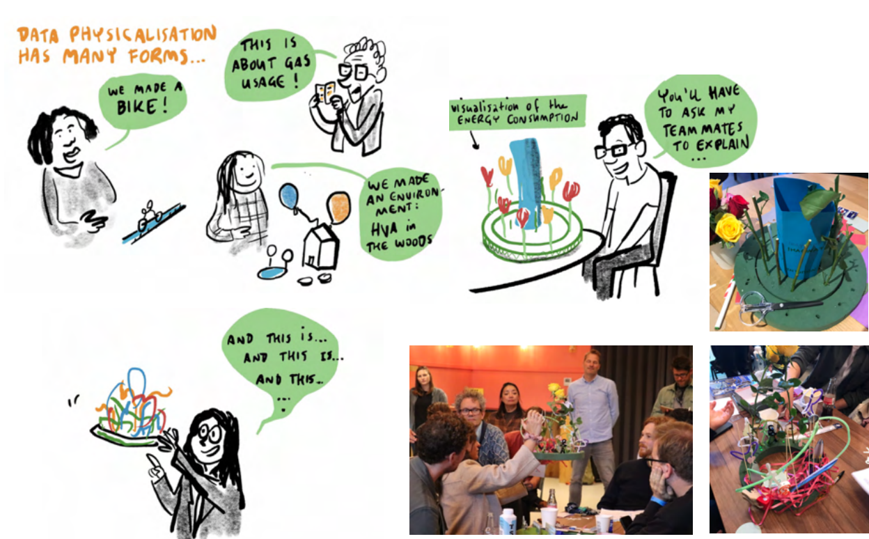
Figure 2: Data physicalization has many forms... and these are not always self-explanatory or easy to explain. Live-cartoons, matched with photos from participants showing data physicalizations of energy consumption, and (un)sustainable practices on a circle platform.