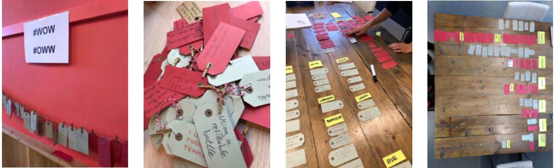
Figure 3: Shown are the workshop intro activity and the physical evaluation with the cards with noted (un)sustainable practices in red (#OWW: Unsustainable) and green (#WOW: sustainable).

Physical thematic analysis of participants' 33 red and 29 green cards (N=62) from the intro activity (Fig. 3) uncovered that participants' input mainly focused on sustainable travel -e.g. 'cycling to the workshop'- and consumption -e.g. 'Using a refillable bottle'-, while the latter might not make the highest sustainable impact. On the other hand, other (un)sustainable practices, namely digital ones such as in the use of technology and data storage and their potential climate impact, were hardly mentioned (n=1). The challenge appeared in uncovering, discussing and focusing on the kind of actions that in comparison will make the most effective impact [35]. The HCI community and data physicalization could play a positive identifying role in this matter.