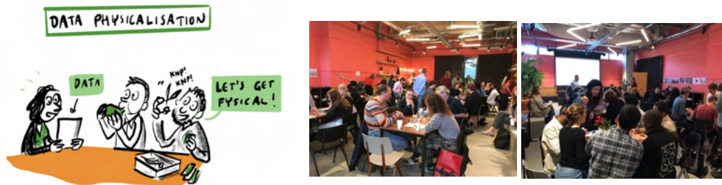
Figure 1: Live cartoon of data physicalization workshop (left), and photos of the setting (right).