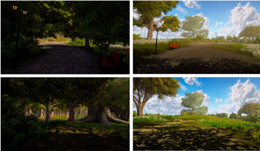
Figure 2. Screen shots of digital nature scenes used in the survey (top-left: dense tended nature; top-right: spacious tended nature; bottom-left: dense wild nature; bottom-right: spacious wild nature).

et al. , 2018), and includes 14 items such as ‘I felt small compared to everything else’ and ‘I experienced a sense of oneness with all things’ ( \alpha = 0.96 ).