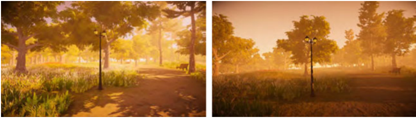
Figure 1. Screen shots of digital nature animations presented during the focus group sessions (left: dense tended nature; right: spacious tended nature).

participants mentioned that they were not able to go into nature as often as they used to or less frequently as they would like: