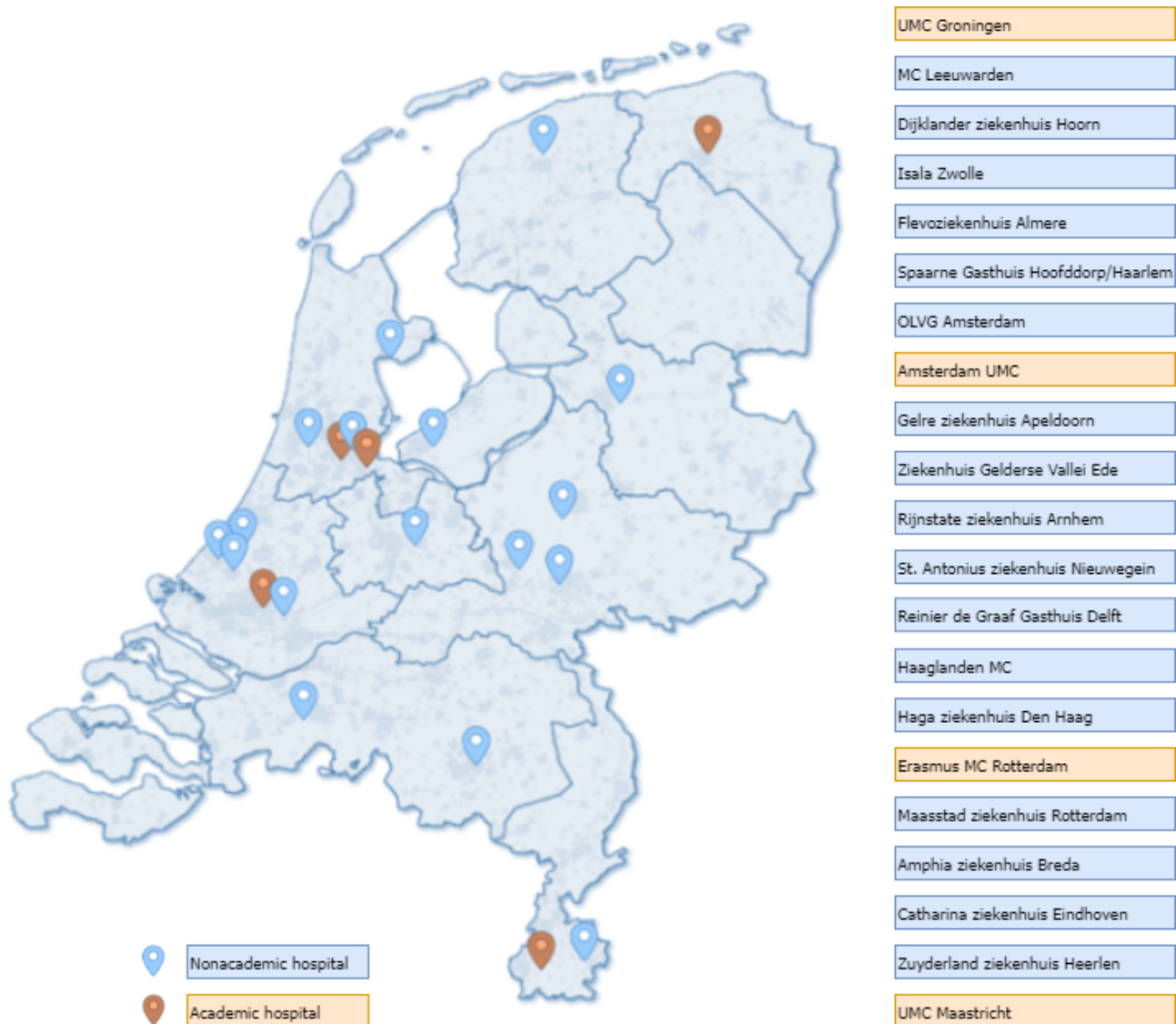
Figure 2. Participating hospitals of the Steroids in Hospitalized Patients with COVID-19 in The Netherlands (SELECT) study. UMC: University Medical Center. MC: Medical Center; OLVG: Onze Lieve Vrouwe Gasthuis.