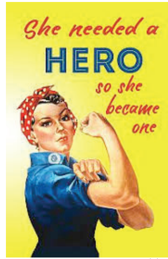
An image to counter gender bias?

stereotypes. In movies and fairy tales, young pretty girls wait for their princes to come so their life can be fulfilled. Men should be rich, royal, or warriors to stand any chance to mate (!). Turn on the TV and most advertisements take advantage of lazy stereotypes to find way into consumers' brain. If an ad for detergent features a husband, consumers may have a slightest chance of cognitive dissonance. And so, let's avoid it.