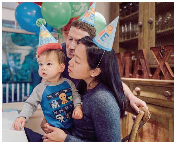
mark Zuckerberg/ Facebook

How often that girls are taught to do chores while son are free to play videogames? Why do we overprotect daughters to the point of near captivity but let boys roam around to gain experience? Why girls can't be girls but "boys will be boys"? How often do we expect